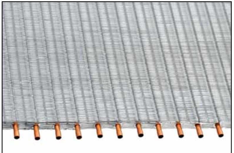
These smaller-diameter copper tubes with inner grooves provide high-efficiency and reduced size and weight. This is one section of a condenser coil from Midea.

Thanks for your interest in this technology! ICA and its members wish you much success and prosperity in your development of energy efficiency ACR products.